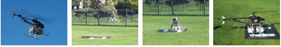
Fig. 1. A typical autonomous landing maneuver

helicopter is derived by minimizing the function