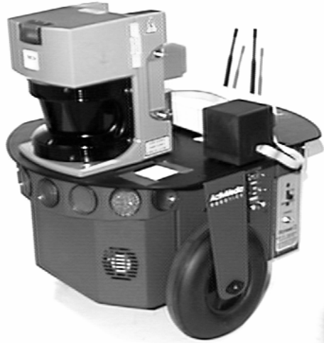
Figure 1: Player can control many popular robot devices, including the Pioneer 2-DX mobile robot and peripherals pictured here.

ming language that provides socket support, and almost every language does. Client libraries, which encapsulate the details of the Player message protocol and facilitate the development of control programs, are currently available in: C, C++, Tcl, Python, Java, and Common LISP. With language neutrality comes platform neutrality; control programs written in Tcl, Python, and Java can run on almost any modern system, even those running Windows. In addition, the C++ client library has been ported to the Win32 environment.